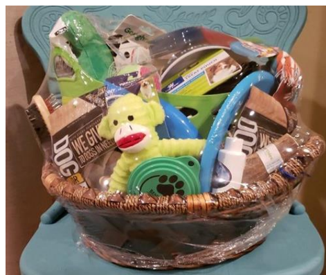
Shrink wrap keeps items looking nice & secure!